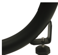
Additional pole-support foot