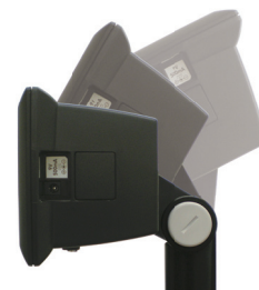
Tilting indicator bracket